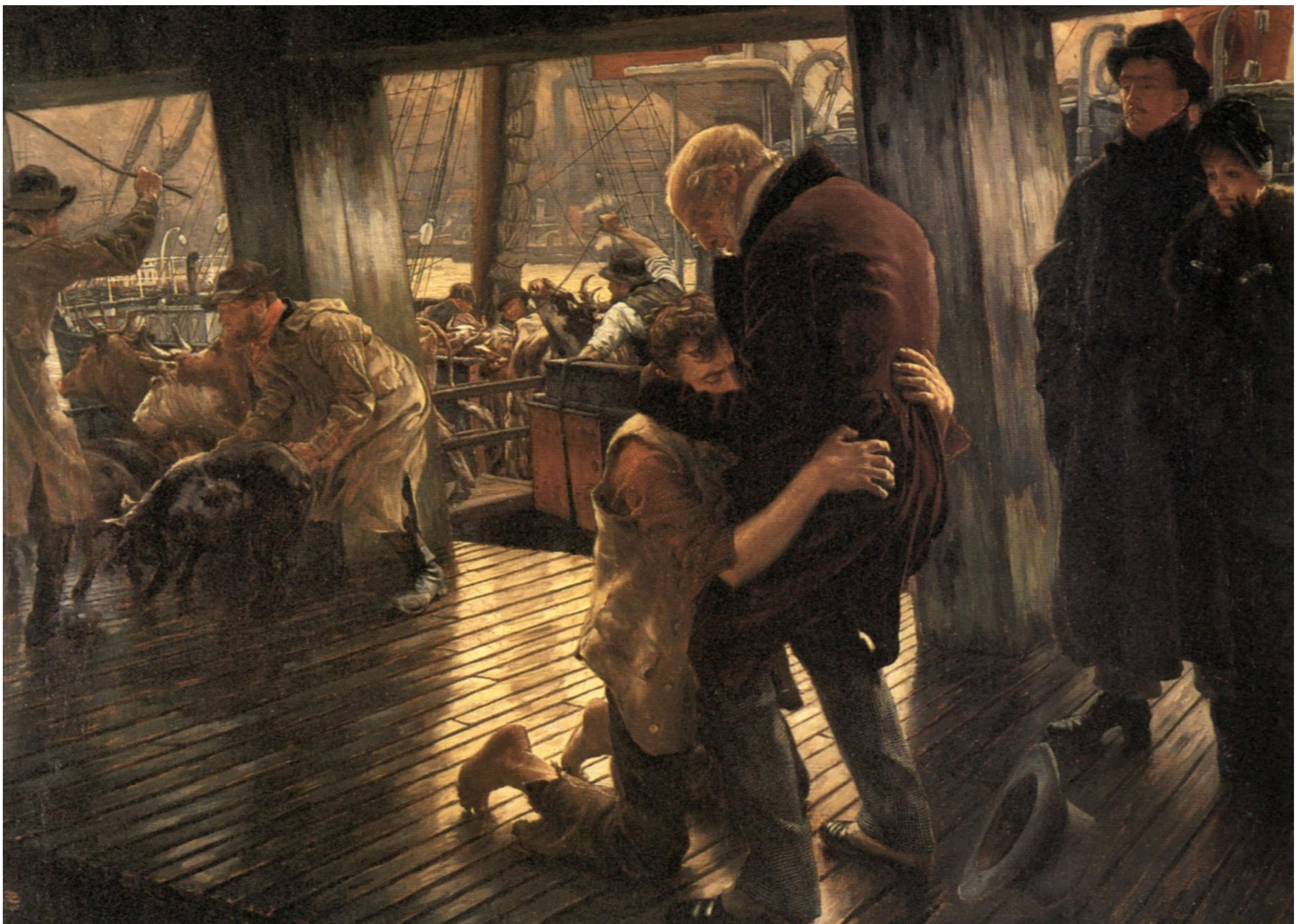
The Prodigal Son in Modern Life: The Return , c. 1882 (James Tissot)