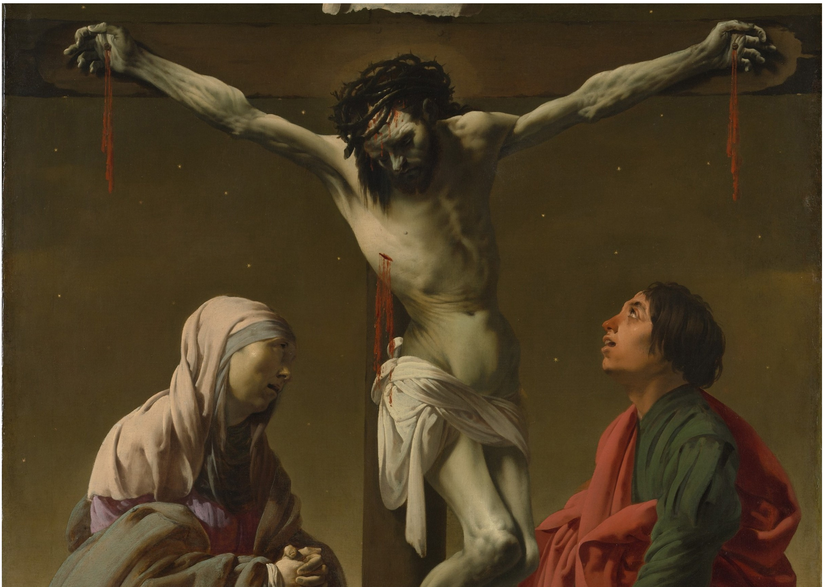
Crucifixion with the Virgin and St. John, c. 1625 (Hendrick ter Brugghen)