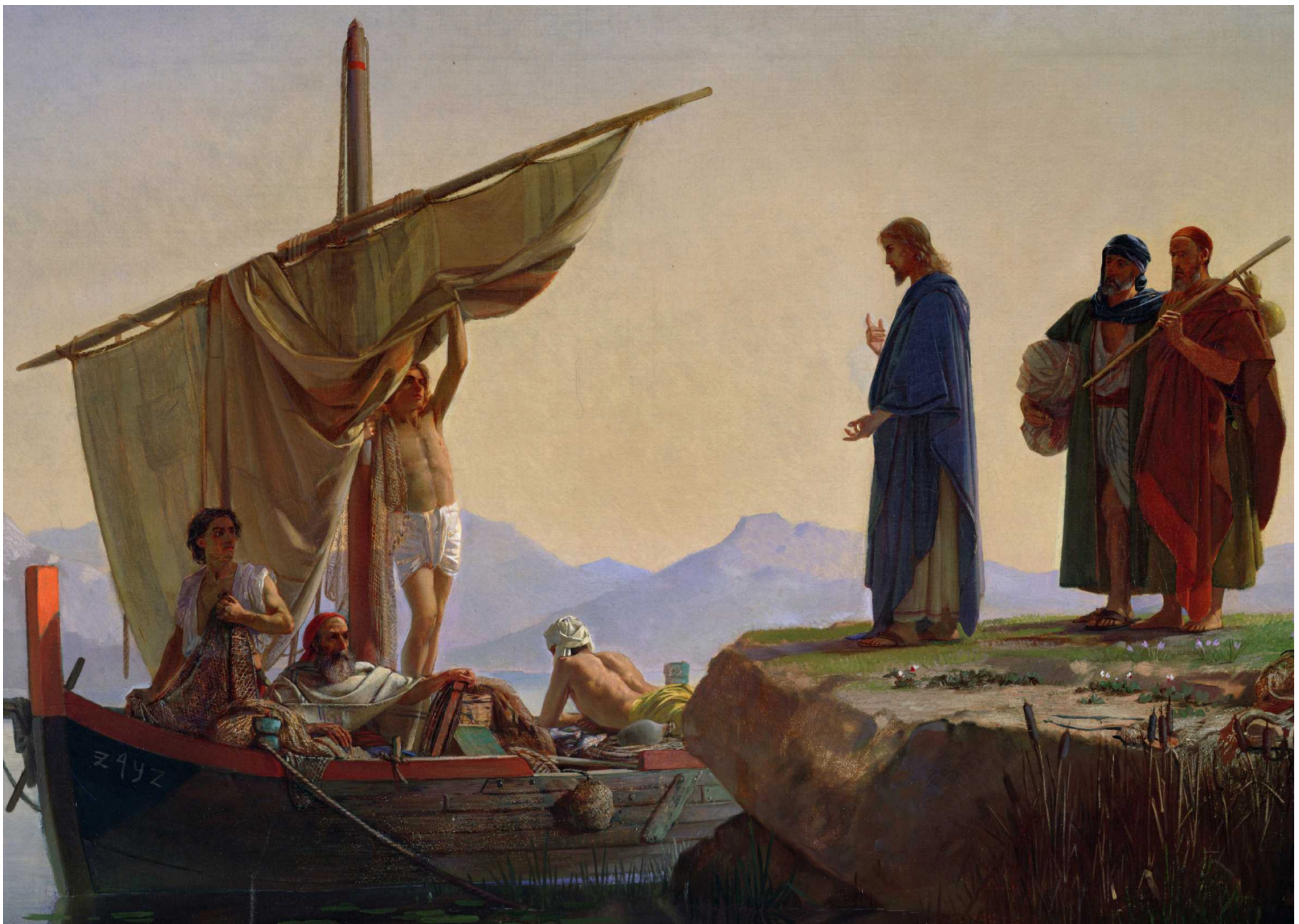
Christ Calling the Apostles James and John, c. 1869 (Edward Armitage)