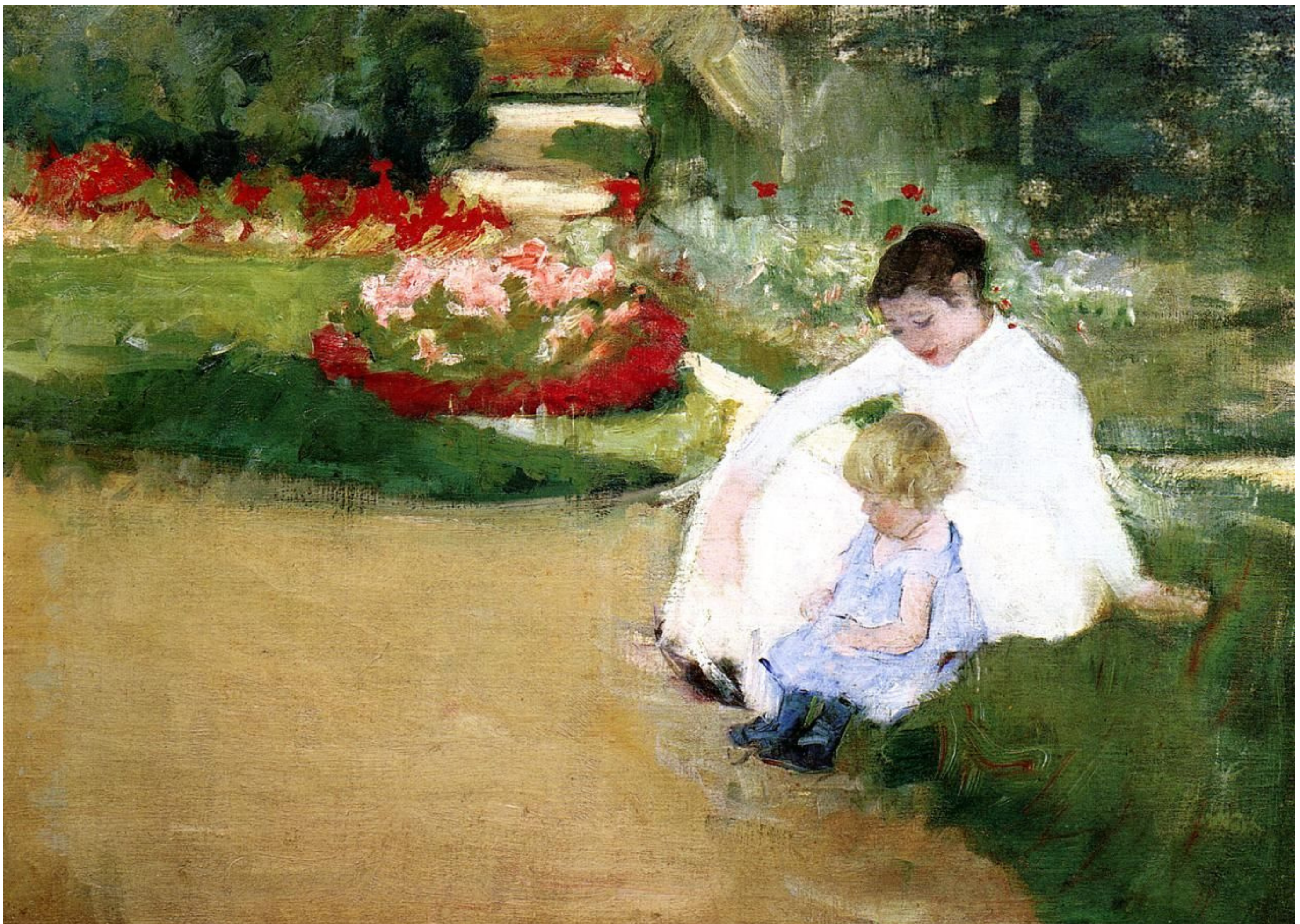
Woman and Child Seated in a Garden , c. 1881 (Mary Cassatt)