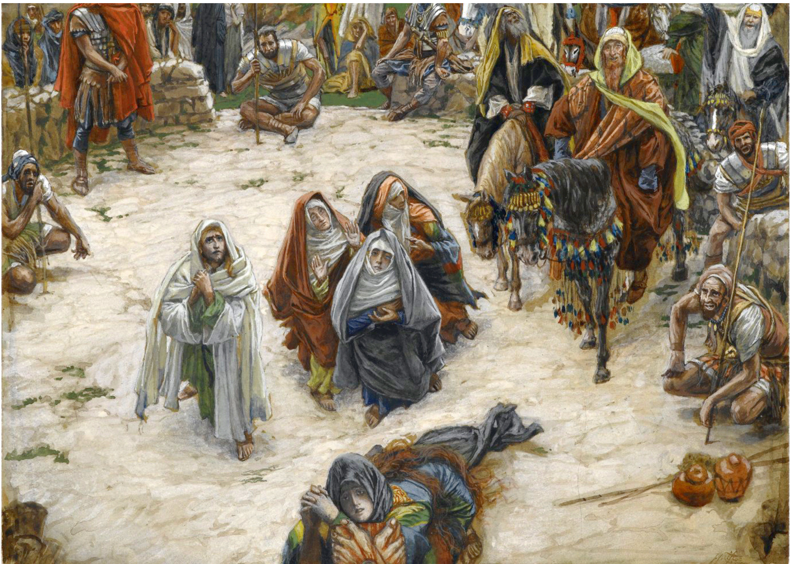
The Crucifixion, seen from the Cross, c.1890 (James Tissot)