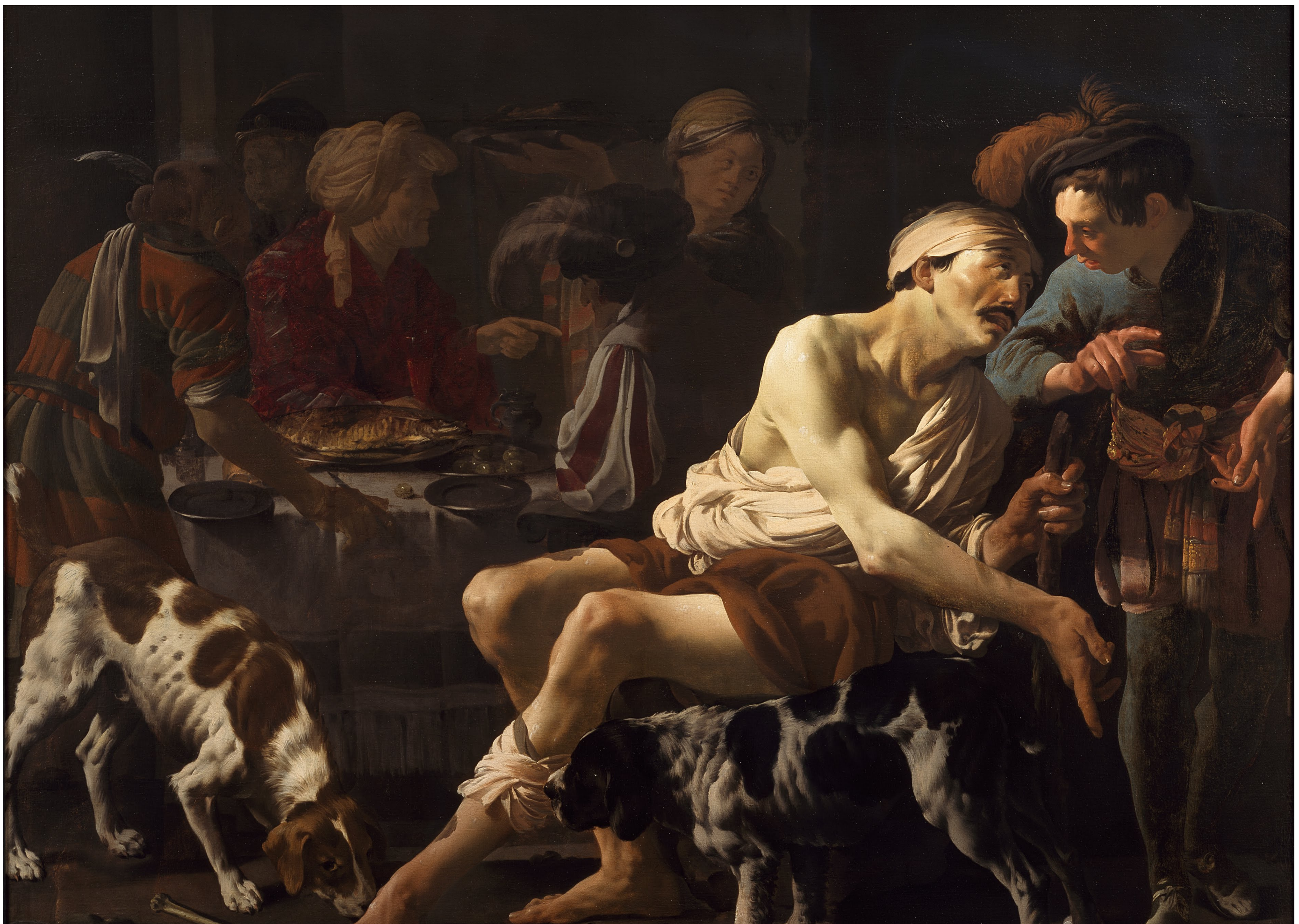
The Rich Man and the Poor Lazarus , c. 1625 (Hendrick ter Brugghen)