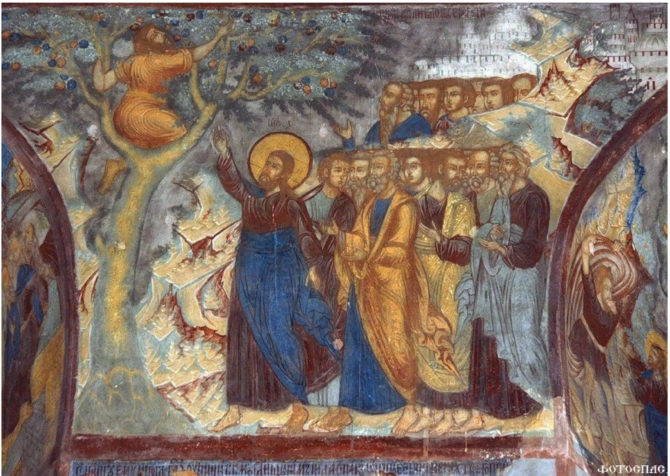
Zacchaeus in the Tree, (Greek Orthodox Icon)