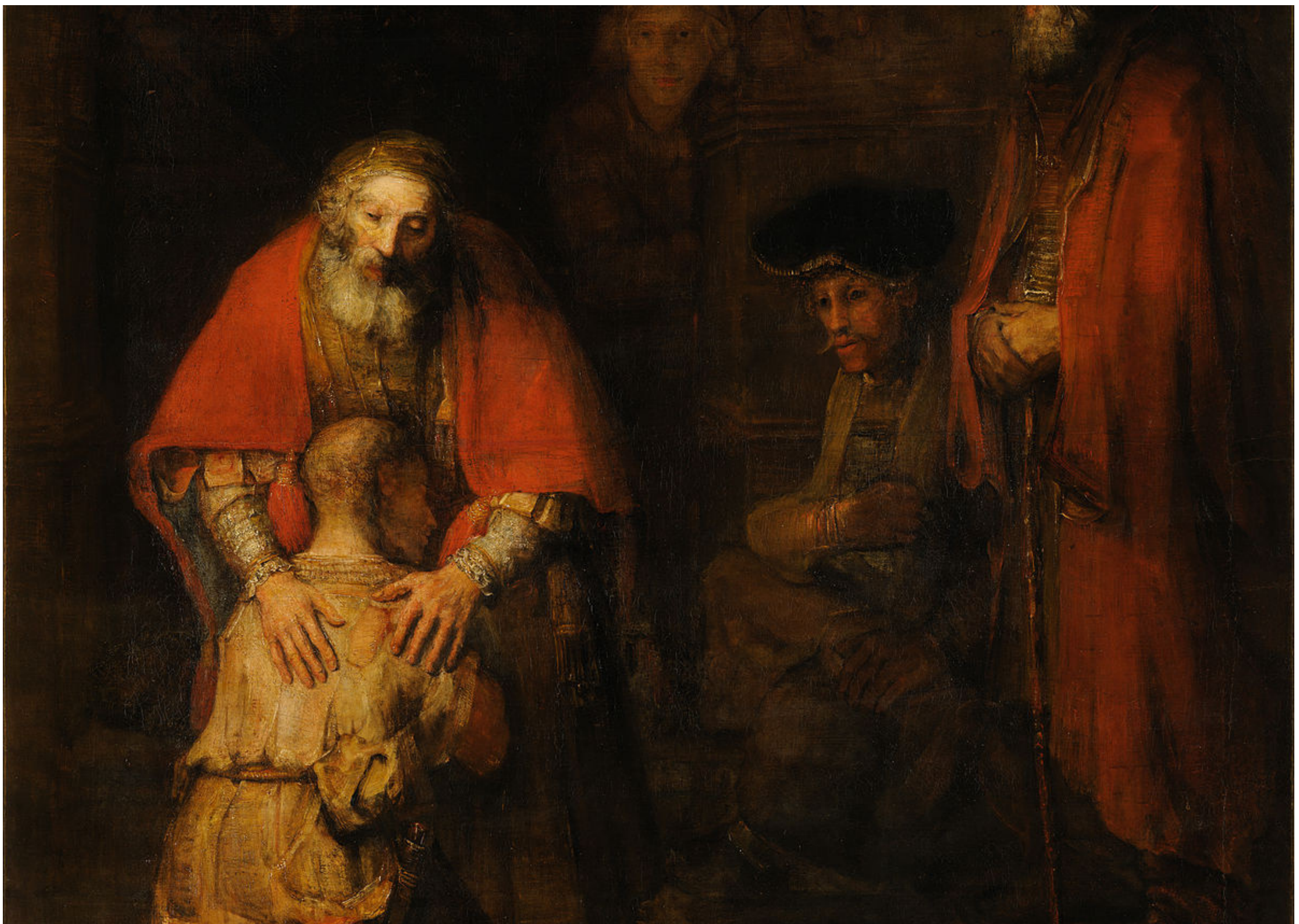
Return of the Prodigal Son , c.1661-1669 (Rembrandt)