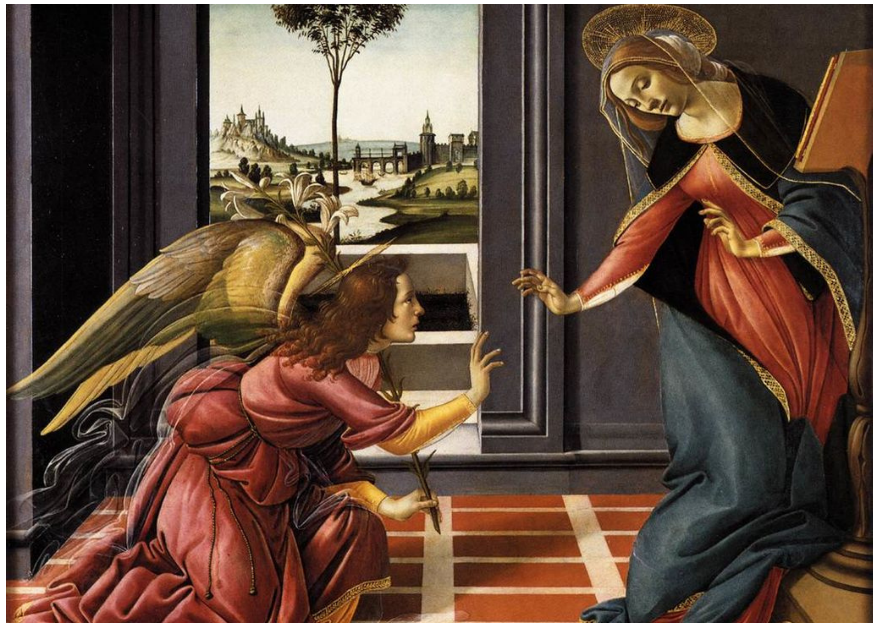
Cestello Annunciation, c. 1445–1510 (Sandro Botticelli)