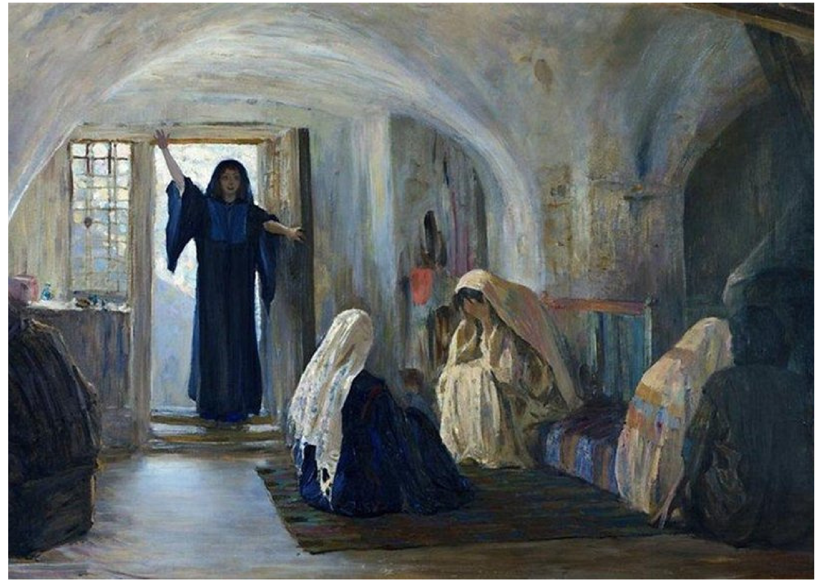
Mary Magdalene Announces the Resurrection to the Apostles, c. 1890 (Vasiliy Polenov)