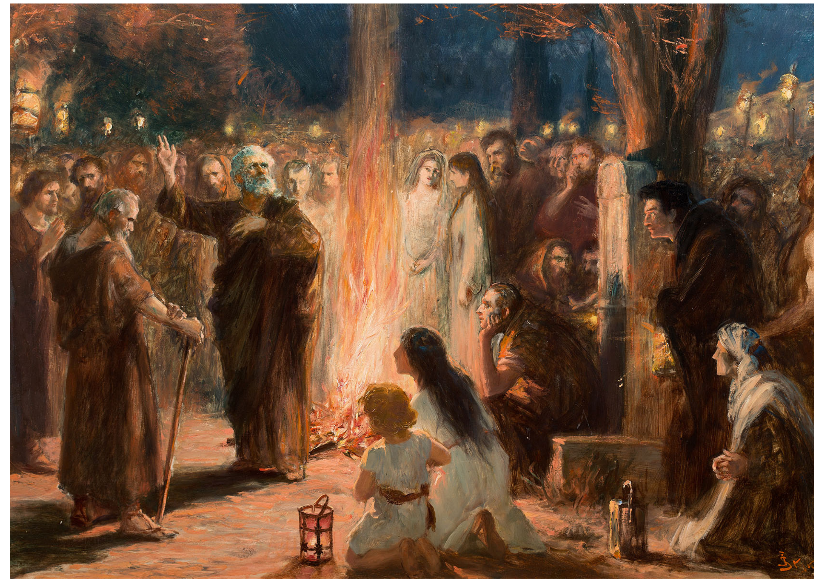
Peter Preaching at the Entrance to the Catacombs, c. 1901 (Jan Styka)